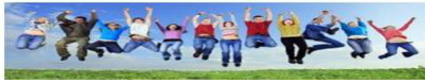
An Adult Must Accompany the Teen Ages 13-17

Parents have the ability to set daily limits on debit card purchases and withdrawals from ATMs.